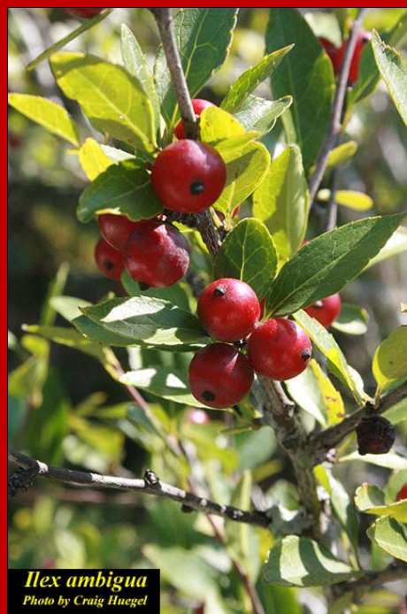
Ilex ambigua

SWFWMD has a web page for comments about hunting on district lands available at: http://www.swfwmd.state.fl.us/recreation/hunt_comments.php . Please check the "representing self" box to avoid your input being received as a canned response for FNPS.