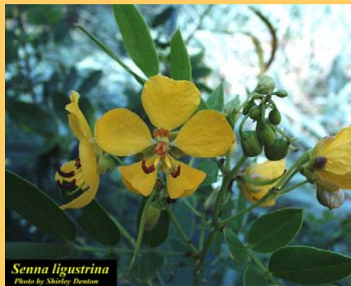
Senna ligustrina