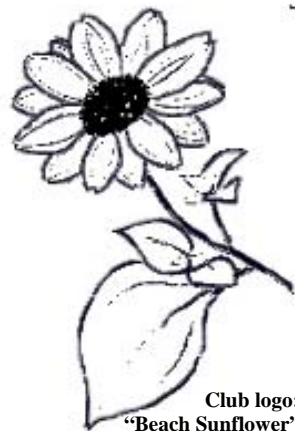
Club logo: "Beach Sunflower" Helianthus debilis