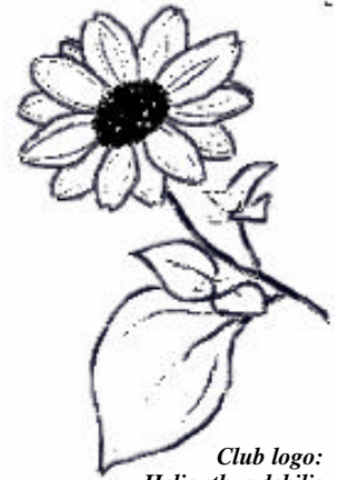
Club logo: Helianthus debilis