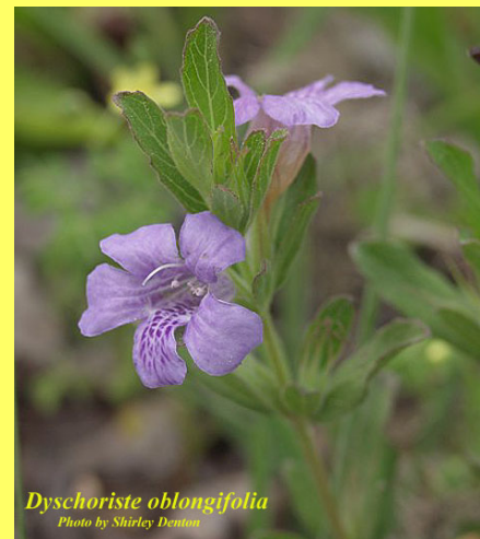
Dyschoriste oblongifolia