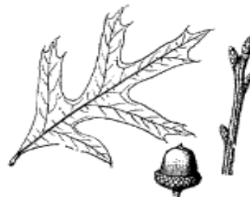
Botanical drawing from Florida Division of Forestry

Wildlife benefit: Provides good cover for birds and other wildlife.